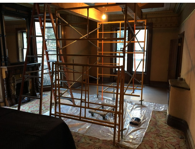
Scaffolding holding up parlor ceiling

There is without a doubt still a lot of work ahead for us in the coming years. "Hard" and "messy" seem an accurate description for what lies ahead, and yet we are devoted to seeing it done. We would not be where we are without the support and encouragement of our donors and members. The generosity of the community and HGI membership has been instrumental in getting us where we need to be. At the time of this writing we have raised well over half of the required funds and look forward to reaching our goal sometime this year. For ways to get involved or to check on the progress of this project you can visit our website at www.historicgeorgetown.org .